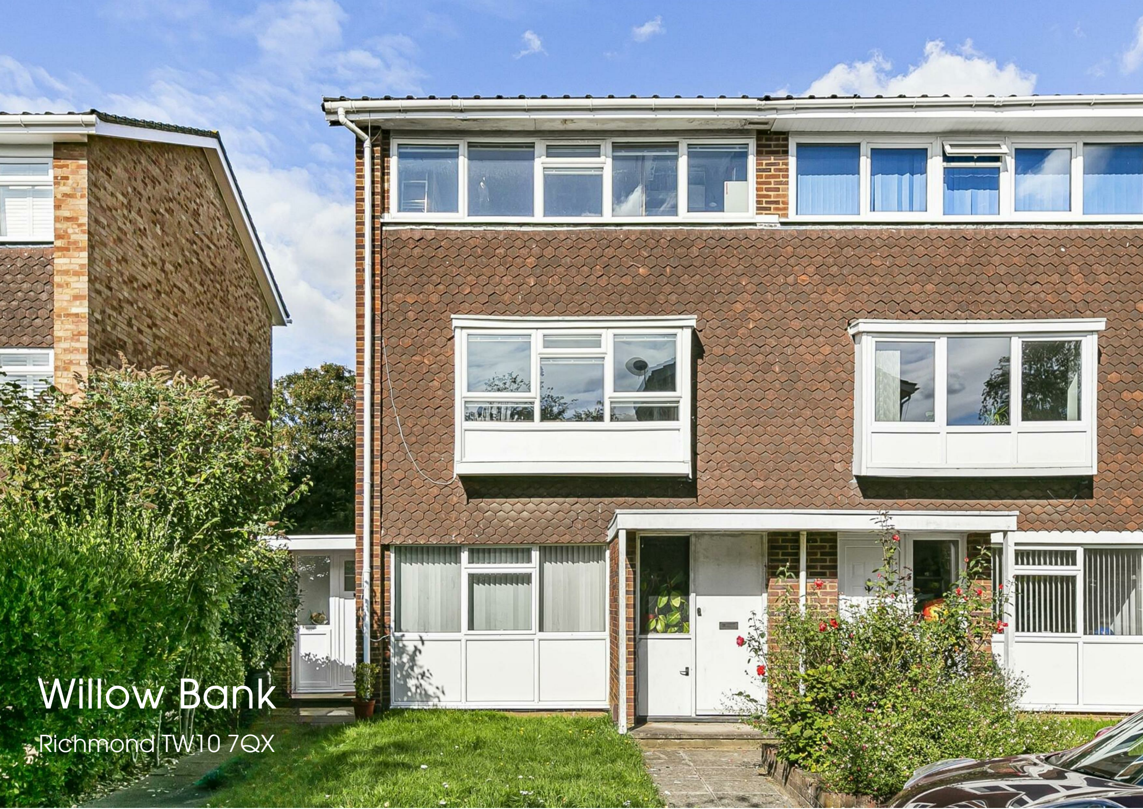
Willow Bank Richmond TW10 7QX